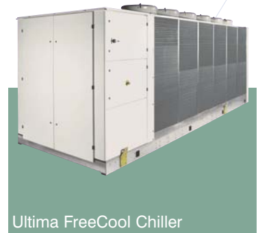
Ultima FreeCool Chiller

Now, with the cooling load on site increasing and new free-cooling technology available from Airedale, forward-thinking management at Epson has superseded the two existing Airedale chillers with three Ultima FreeCool chillers that will expand system capability at the same time as significantly cutting energy costs.