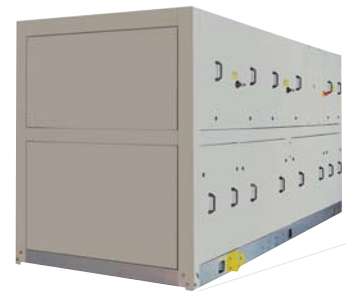
UWC 1200D designed for HIC

Set as 'run and standby' and pre-supplied with non-ozone depleting R407C refrigerant, the two UWC chillers utilise far less refrigerant charge than the chillers they have replaced and are a lot more efficient. One unit is able to manage the whole system.