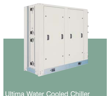
Ultima Water Cooled Chiller