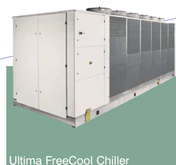
Ultima FreeCool Chiller