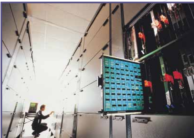
Precision Air Conditioning Applications