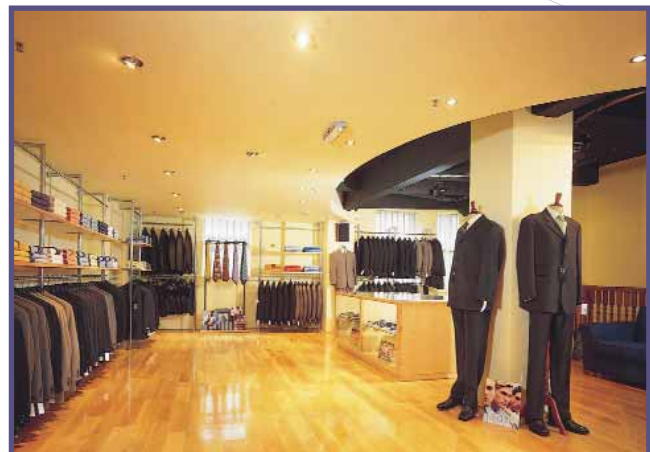
Comfort Cooling Applications