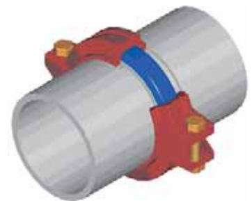
Cut away section of a victaulic pipework connection