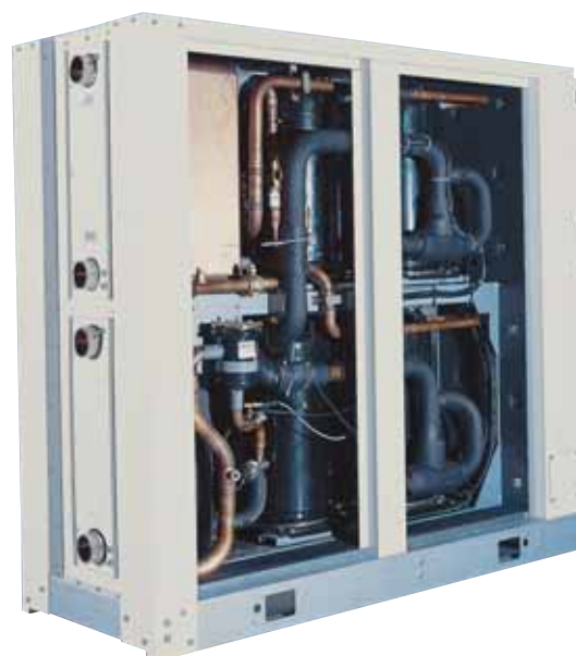
Ultima Water Cooled Chiller DQ / DSQ model with panels removed