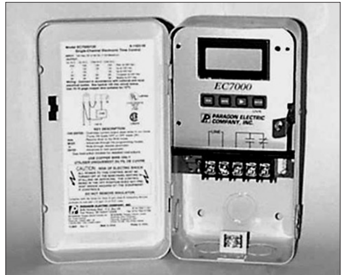
Figure 1.1 EC7000 Time Clock

As a 24-hour control, the same ON/OFF program is utilized each day of the week, Saturday and/or Sunday, or any other day may be skipped. When schedules vary from day to day, the 7-day programming capability allows for a different schedule each day of the week, with up to 16 setpoints available.