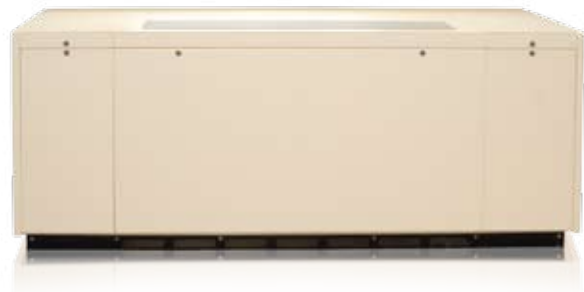
Varsity Under-the-Window Vertical Unit Ventilator