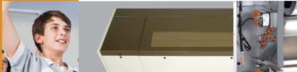
14-Gauge cabinets with pencil-proof clear anodized aluminum bar grilles are available in a variety of one or two-tone colors.

Teachers love the quiet. Administrators love the low operating costs. Facility managers love the low-maintenance and serviceability. The Varsity has been perfected to continue to deliver what's important for schools today ... fresh air for a safe and healthy learning environment.