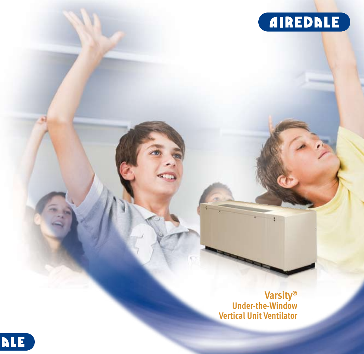
Varsity® Under-the-Window Vertical Unit Ventilator