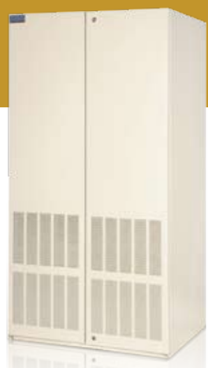
SchoolMate HE Water/Ground Source Heat Pump with R410a