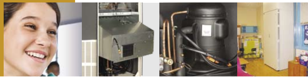
ERV is easily removable for maintenance and cleaning.